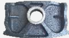
BRACKET HYVA 149