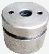
UT 4568 (Datl Inner Piston)